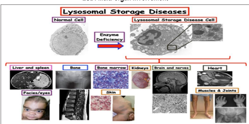
LSD: Multi-organ involvement